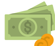
Extra Cash Small bills