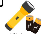
Waterproof Flashlight and Extra Batteries